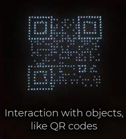
Interaction with objects, like QR codes