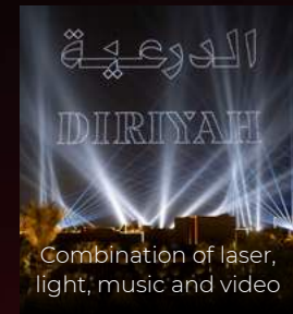
Combination of laser, light, music and video