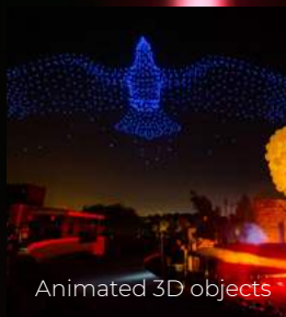
Animated 3D objects