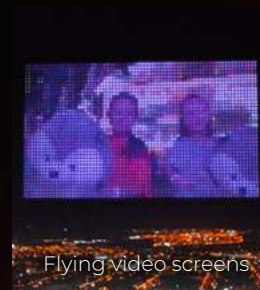
Flying video screens