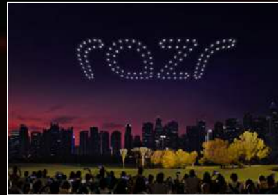
Visualization as image

We enable the flexible creation of individual shows and coordinate content and procedure with you. With the help of advanced design software, including WYSIWYG 3D, we visualize and refine the programming and can give you insights at any time - as an image as well as a video preview.