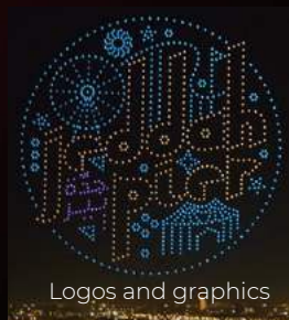
Logos and graphics