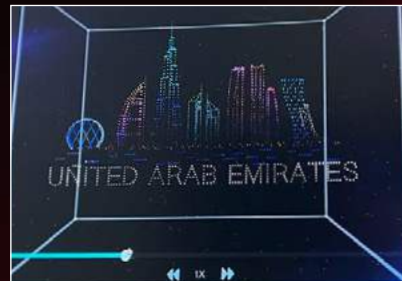
Visualization as video